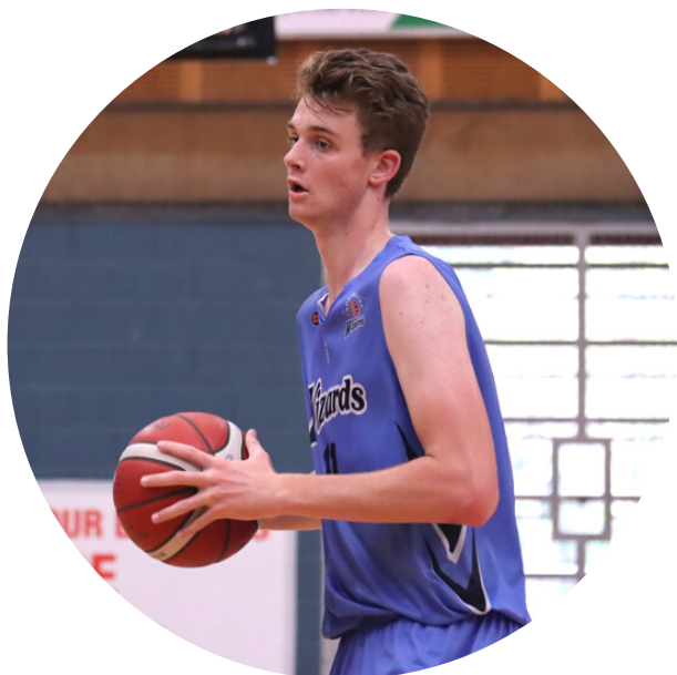
NORTHSIDE WIZARDS UNDER 16 BOYS CHAMPIONS