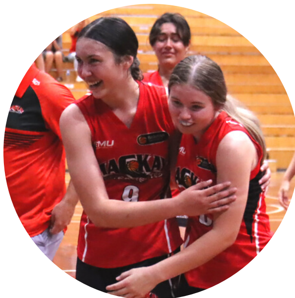
MACKAY METEORETTES UNDER 16 GIRLS CHAMPIONS