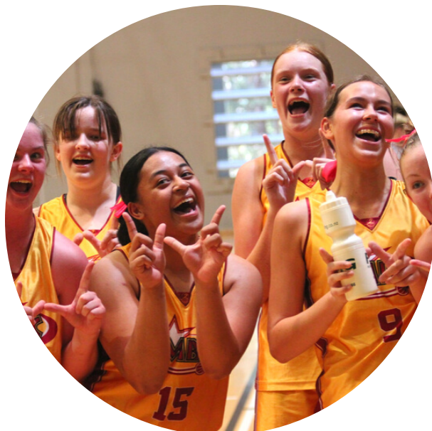
MORETON BAY GIRLS COLLEGE CBSQ SECONDARY GIRLS CHAMPIONS