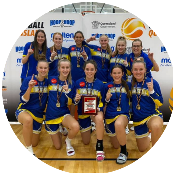
TOWNSVILLE FLAMES UNDER 18 GIRLS CHAMPIONS