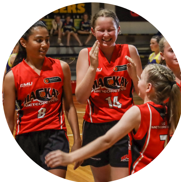
MACKAY METEORETTES UNDER 12 GIRLS CHAMPIONS