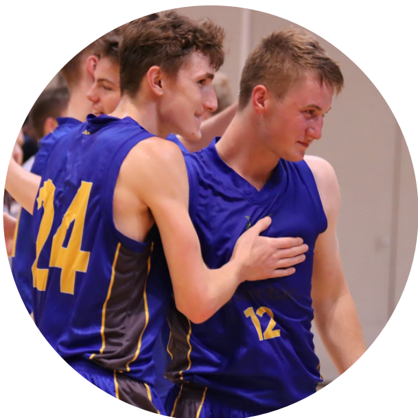
ANGLICAN CHURCH GRAMMAR SCHOOL CBSQ OPEN BOYS CHAMPIONS