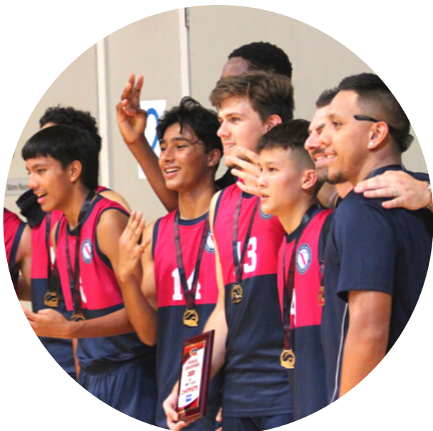
BRISBANE SHS CBSQ SECONDARY BOYS CHAMPIONS