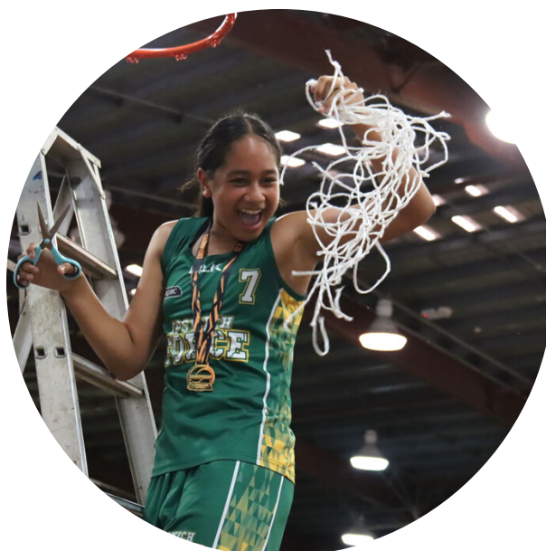
IPSWICH FORCE UNDER 14 GIRLS CHAMPIONS