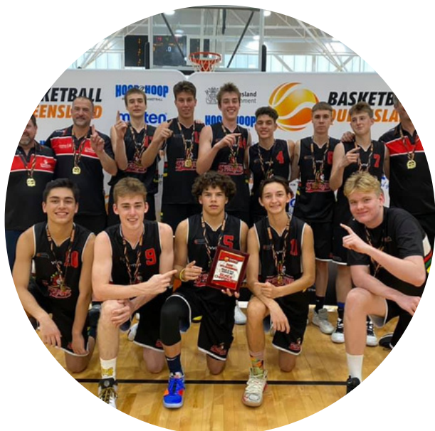
SOUTHERN DISTRICTS SPARTANS UNDER 18 BOYS CHAMPIONS