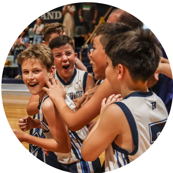
ROCKHAMPTON ROCKETS UNDER 12 BOYS CHAMPIONS