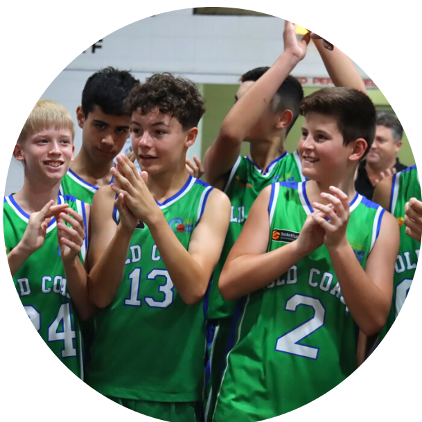
GOLD COAST WAVES UNDER 14 BOYS CHAMPIONS