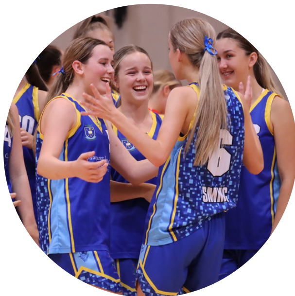
ST MARGARET MARY'S COLLEGE CBSQ OPEN GIRLS CHAMPIONS